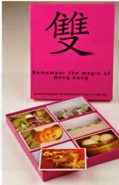
Hong Kong Memory Game, $100, Fragrant Harbour Trading Company