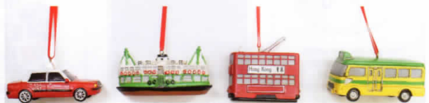
Hanging "Transport" decorations, $100 ($350 for set of 4), The Lion Rock Press