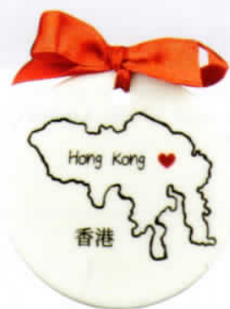
Hong Kong ceramic hanging decoration, $100, available at Bookazine, Landmark Prince's Building, Fragrant Harbour Trading Company