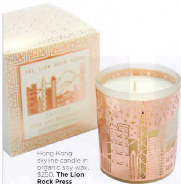
Hong Kong skyline candle in organic soy wax, $250, The Lion Rock Press