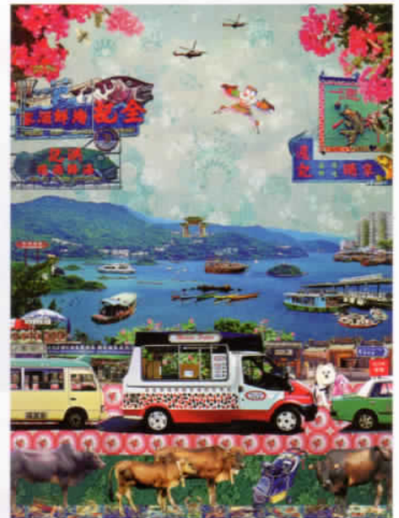
Sai Kung canvas print, available in three sizes, from $2,550, Louise Hill Design