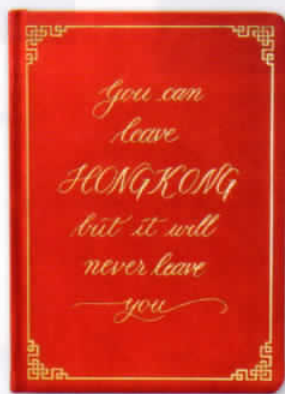
Luxe notebook, $150, The Lion Rock Press