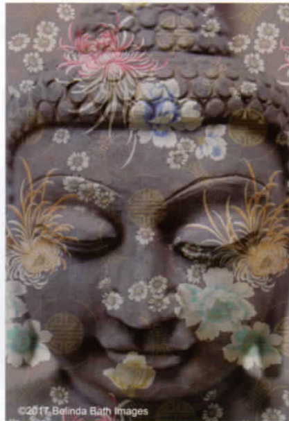
Tattoo Buddhas, available in various sizes, in stretched canvas or framed prints on etching paper, from $3,500, Belinda Bath Images