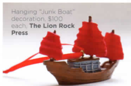
Hanging "Junk Boat" decoration, $100 each, The Lion Rock Press