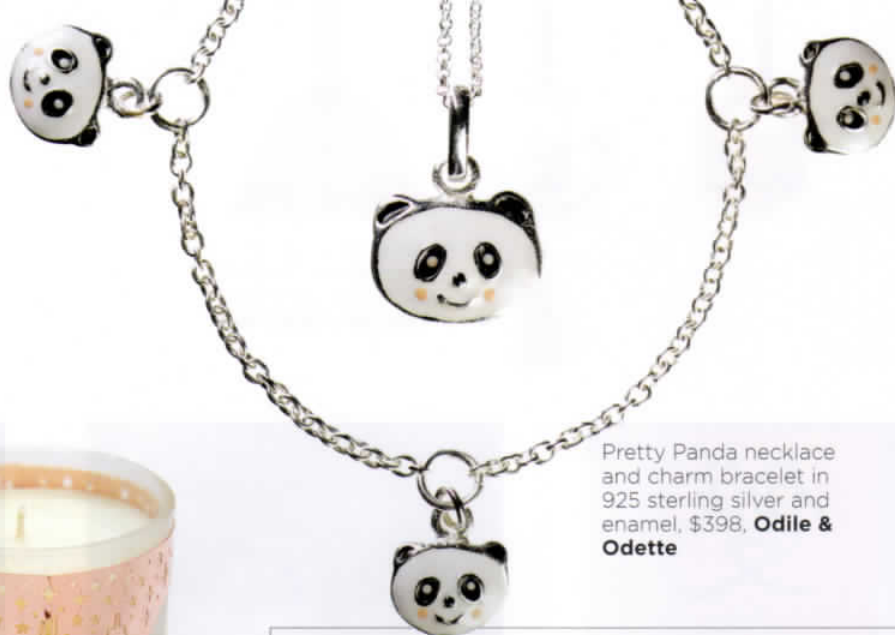
Pretty Panda necklace and charm bracelet in 925 sterling silver and enamel, $398, Odile & Odette