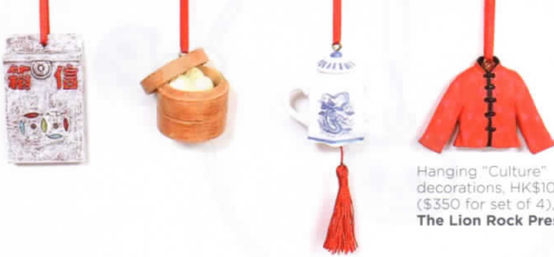
Hanging "Culture" decorations, HK$100 ($350 for set of 4), The Lion Rock Press